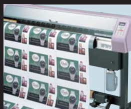
Nesting with the Inkjet plotter JV3 series