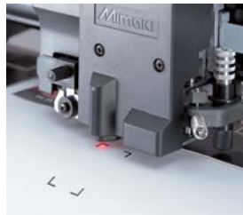
The Optical sensor comes with a LED pointer (Light pointer) for ease of use.

Pouncing tool is available as an option.