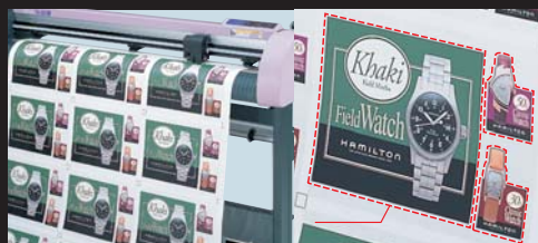
Cutting with the CG-FX series as a Print-cut solution